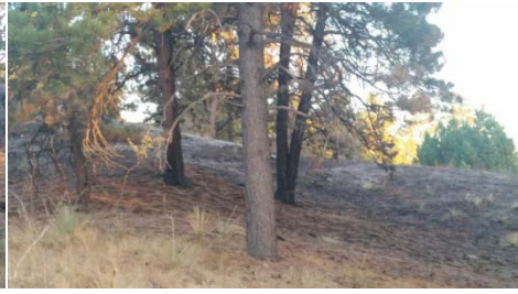
Two views of Spring Creek fire Started by rodent chewing on electrical lines.